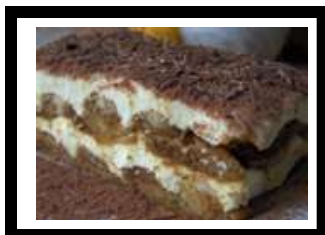
Tiramisu and Cannoli Java, Decaf Java, Tea with Ice

Prices are subject to 21% taxable service charge and applicable sales tax. Prices are subject to change without notice.