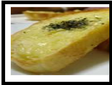
Hot Garlic Bread of Course

Spicy Salami, Pasta, Olives and Cheese with Roasted Red Pepper Vinaigrette